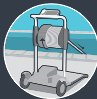
Auto cable release