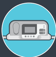
MMI - Interface control, operation modes & analyzing