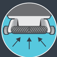
Dual direction brush