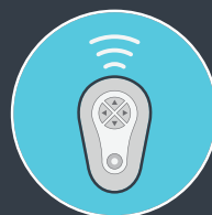
Remote control for manual manoeuvring