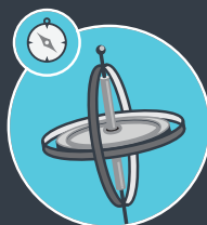
Auto direct intelligent self-learning scanning technology