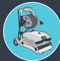
Multipurpose Caddy with Auto Cable Release