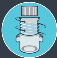
Spiral two layer system