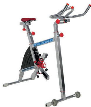
AquaBike Professional Red

All Aquabikes from the Pro Line (Professional/Pro Fix/Pro Statiq) are also available in the red version.