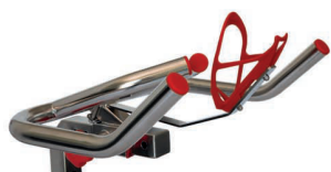
Bottle Holder red