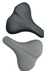
Extra wide Seats