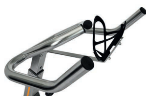
Bottle Holder black

Hydrorider allows you to customize all Aquabikes with red or black bottle holder, colored seats, extra wide seats, comfort pedals (for use without shoes) with or without resistance, bases with suction cups for use in pools with smooth tile bottoms.