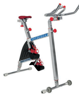
AquaBike Pro Statiq Red