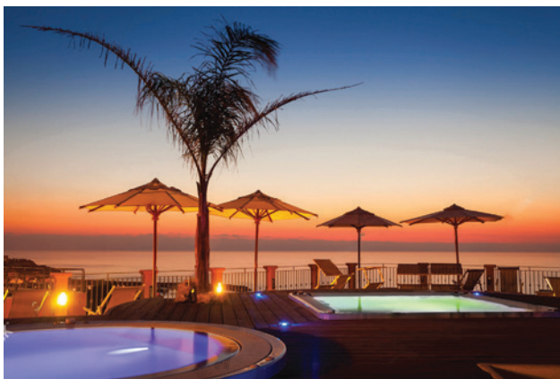
ColorTouch System controls color changes of two pools at the same time