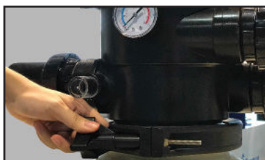
Unique one-piece clamp with screw-type lock design to simplify installation and allows tool-free serving

Emaux innovative design and advanced technology offers superior filtration performance and crystal clear water. Max series filters are blown at one-piece with high density polyethylene for its heavy duty performance and reliability.