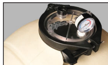
Easy-to-read pressure gauge for inspection