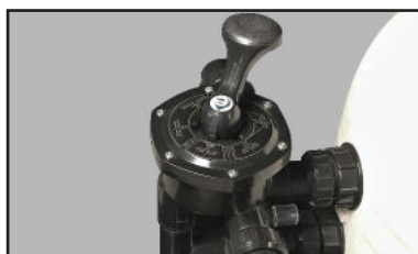
Equipped with a 6-way multiport valve