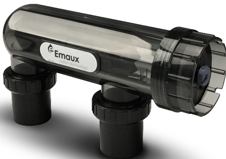
Titanium cell with 2 meters cable

Salt chlorinated pools are among the best to enjoy a comfortable bath, but such systems tend to raise pH. With SSCone you get the right solution: its automatic dosing pump injects acid to achieve the proper pH balance, obtaining the most efficient chlorine generated by the Emaux cell. No harmful by-products. It is programmed automatically.