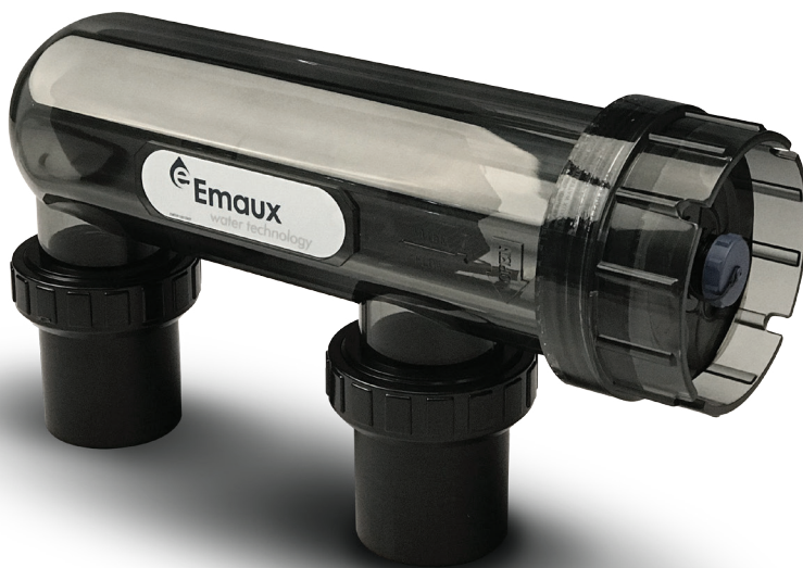
Titanium cell with 2 meters cable

Salt chlorinated pools are among the best to enjoy a comfortable bath, but such systems tend to raise pH. With SSCone you get the right solution: its automatic dosing pump injects acid to achieve the proper pH balance, obtaining the most efficient chlorine generated by the Emaux cell. No harmful by-products. It is programmed automatically.