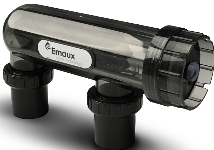
Titanium cell with 2 meters cable

Salt chlorinated pools are among the best to enjoy a comfortable bath, but such systems tend to raise pH. With SSCone you get the right solution: its automatic dosing pump injects acid to achieve the proper pH balance, obtaining the most efficient chlorine generated by the Emaux cell. No harmful by-products. It is programmed automatically.