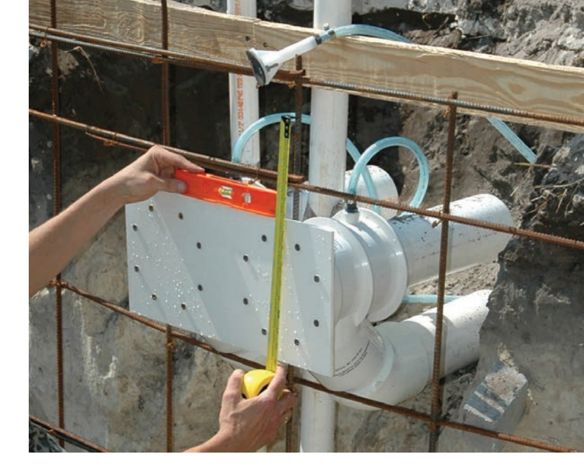
Note: All BADU SwimJet Systems are provided with installation instructions for various pool construction types: new and existing gunite or concrete pools, pools with liners, and fiberglass pools.