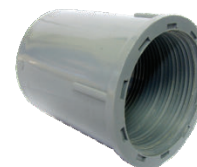
Concrete Housing for UL-P50 Light