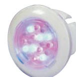
Auto Color Change