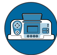
MMI – interactive digital interface