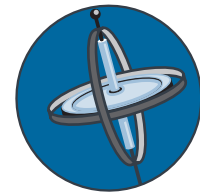
Gyro XL scanning