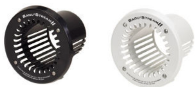
Optional round covers available in the colors black, gray, and white.

Consult your physician before attempting any strenuous exercise. This product may not be challenging or satisfying for all levels of exercise.