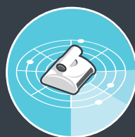
CleverClean™ scanning system