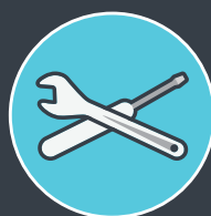
Fast Fix, easy repair