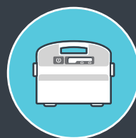
Power supply with Full filter bag indicator