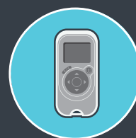
Remote control unit