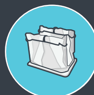
Fine and ultra-fine porosity filter