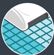
Thorough active brushing