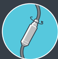
Swivel prevents cable twisting